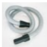
Standard treatment hose