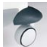
Wheel with brake

Zimmer Elektromedizin GmbH Junkersstraße 9 D-89231 Neu-Ulm Tel. +49. (0)7 31. 97 61-291 Fax +49. (0)7 31. 97 61-299 export@zimmer.de www.zimmer.de